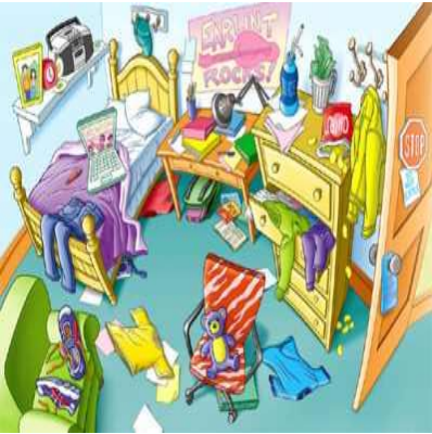
Victor's bedroom was very messy